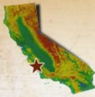
MAP & DIRECTIONS