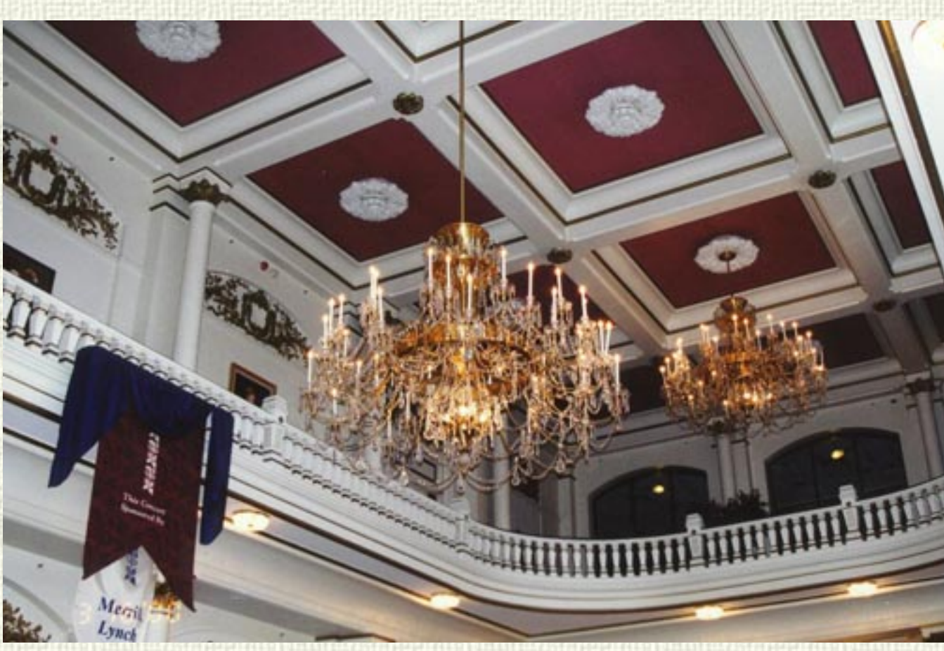
with the coffered ceiling