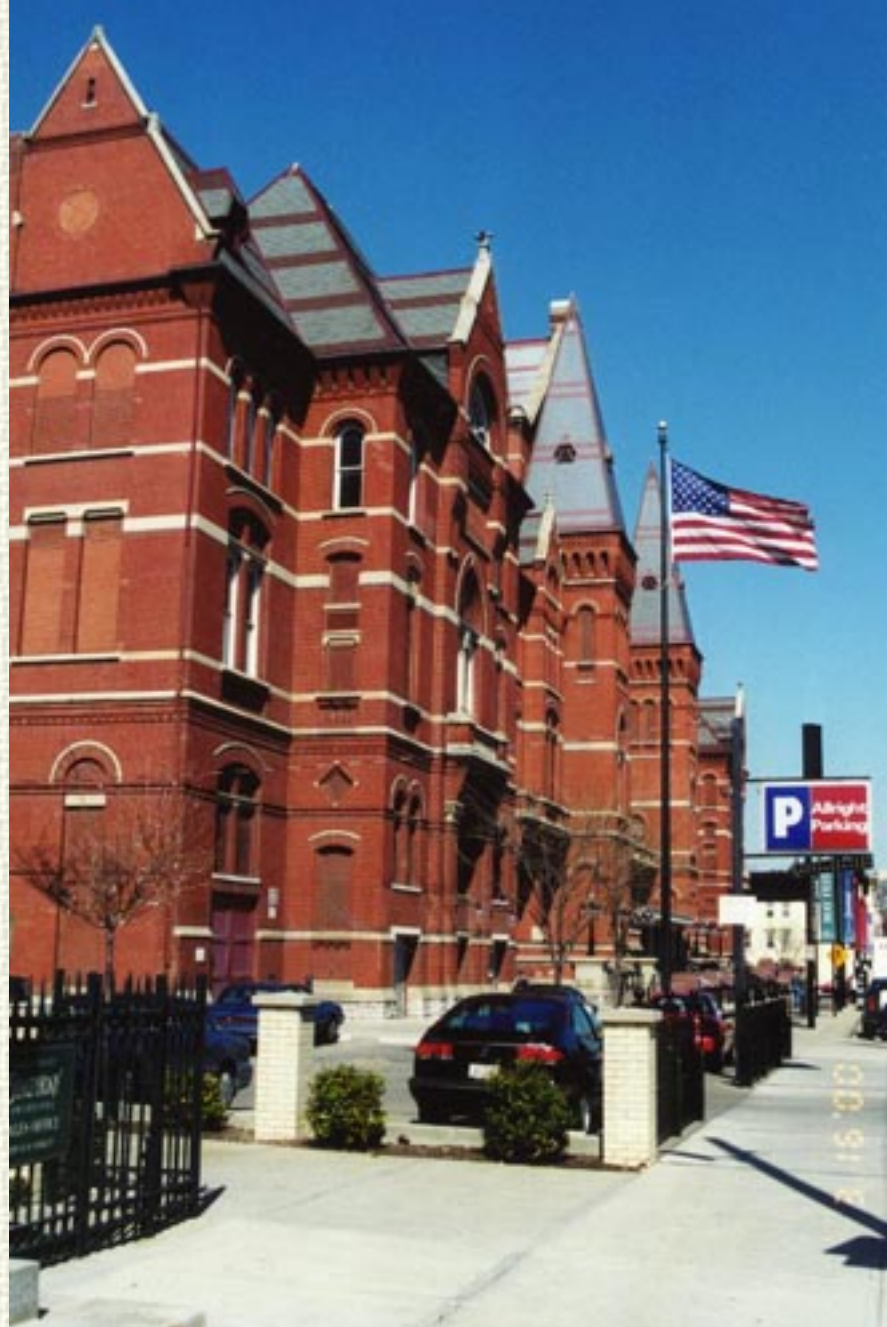
The Cincinnati Music Hall, located near Washington Park, is the home of the Cincinnati Symphony